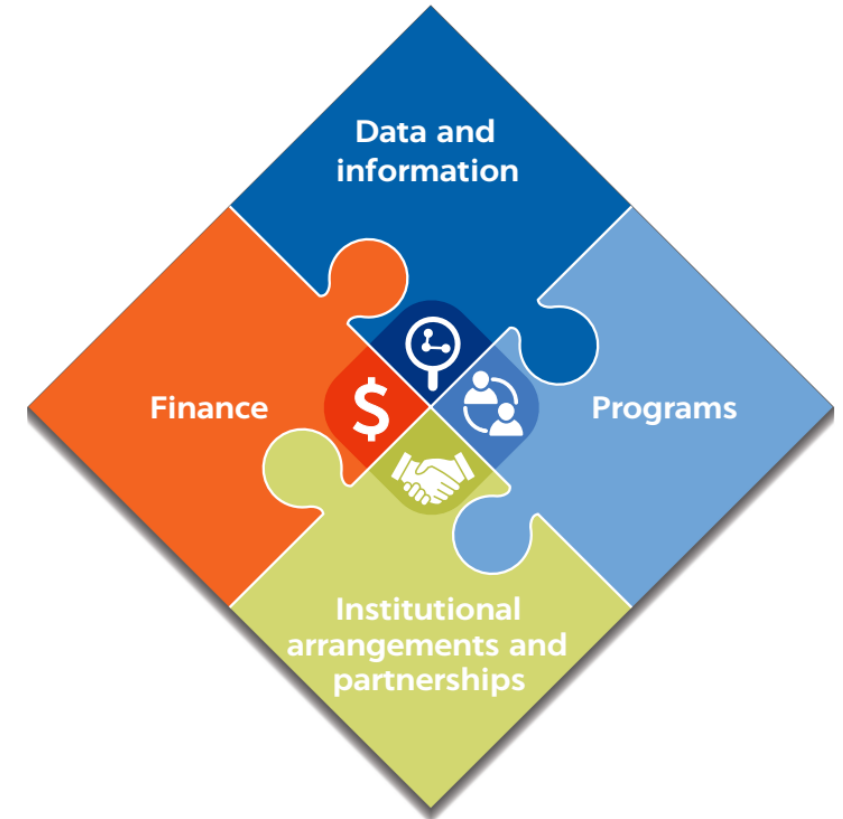
Framework for adaptive social protection: Four building blocks